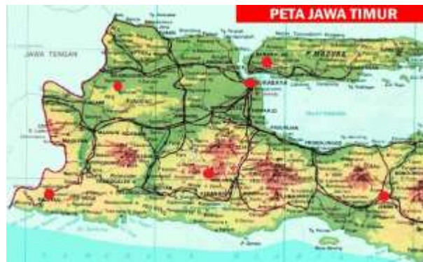
Figure 1. Area of School Participants in East Java.